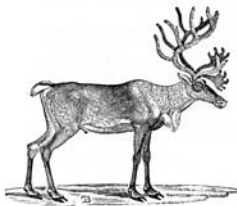
THE REIN-DEER. ( Cervus Tarandus , Lin.— Le Renne , Buff.)